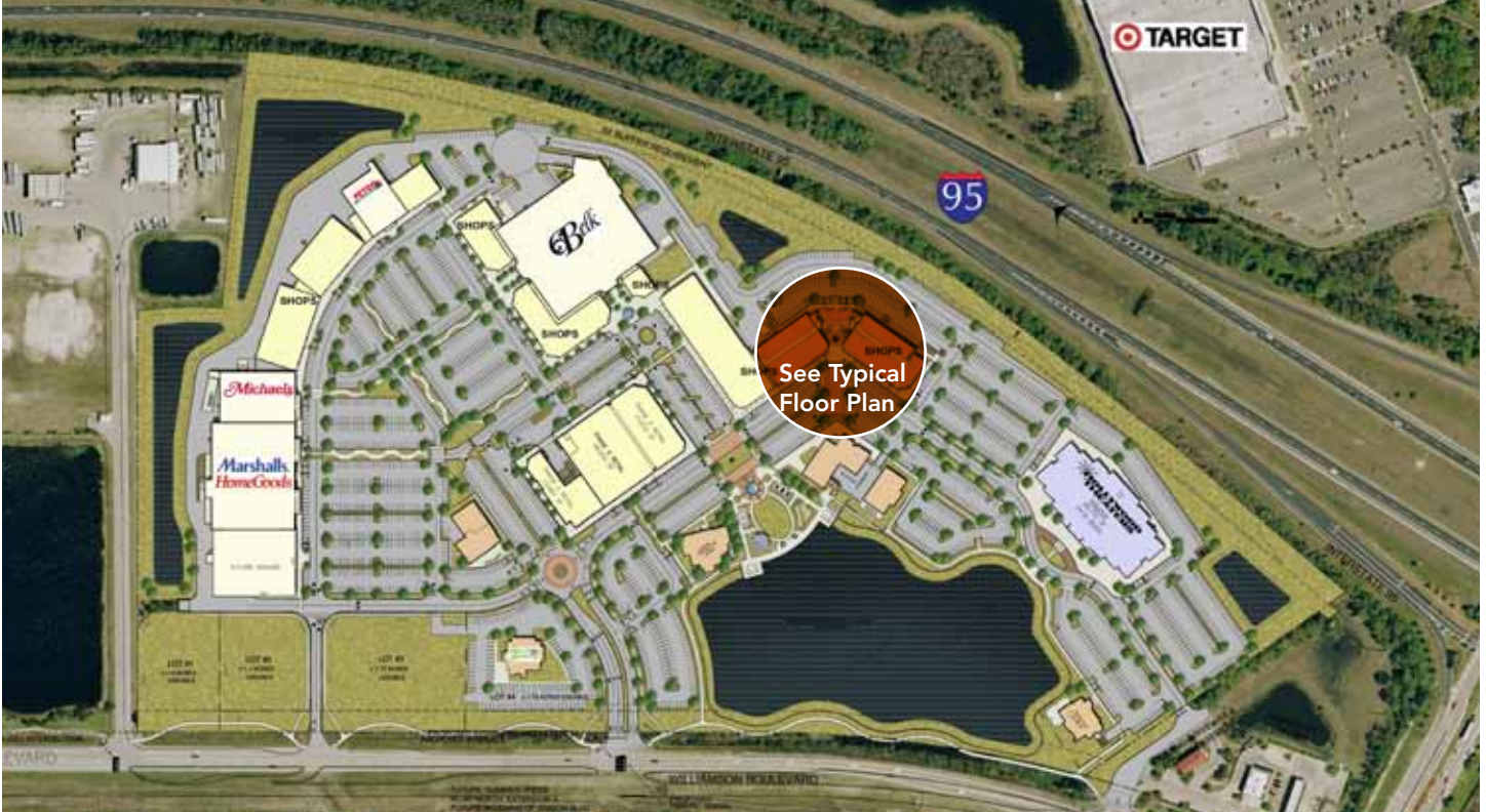
Typical Floor Plan - 34,000 SF