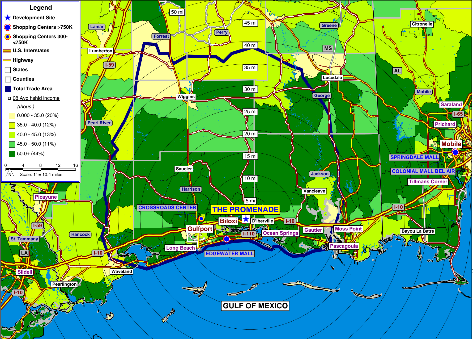
D'Iberville, MS (Biloxi/ Gulfport)